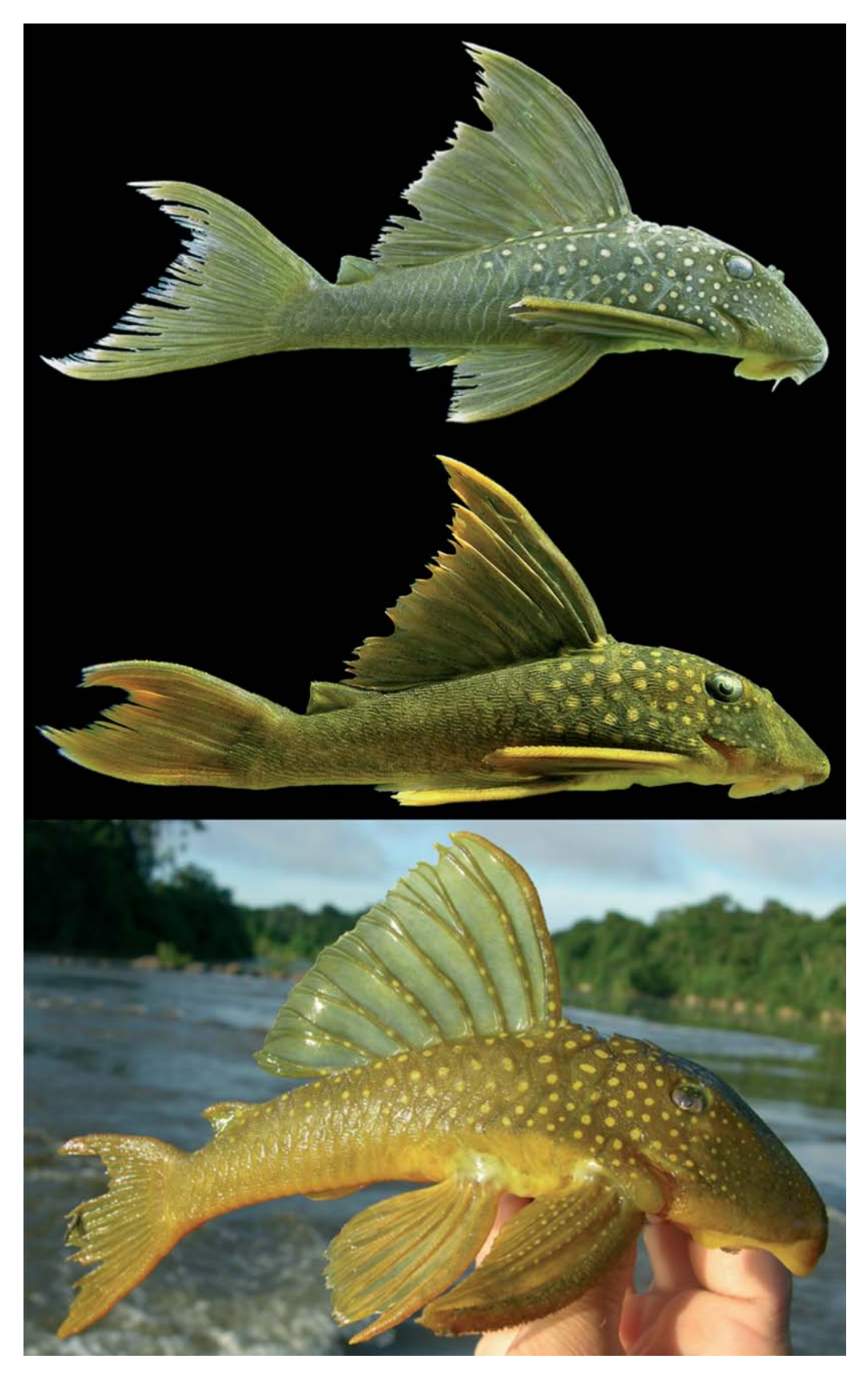
Fig. 1. Live specimens of a: Baryancistrus demantoides , adult, AUM 42034, paratype, 96.3 mm SL; b: B. demantoides , juvenile, MCNG 54031, paratype, 54.1 mm SL; c: Hemiancistrus subviridis , AUM 42933, 146.9 mm SL.