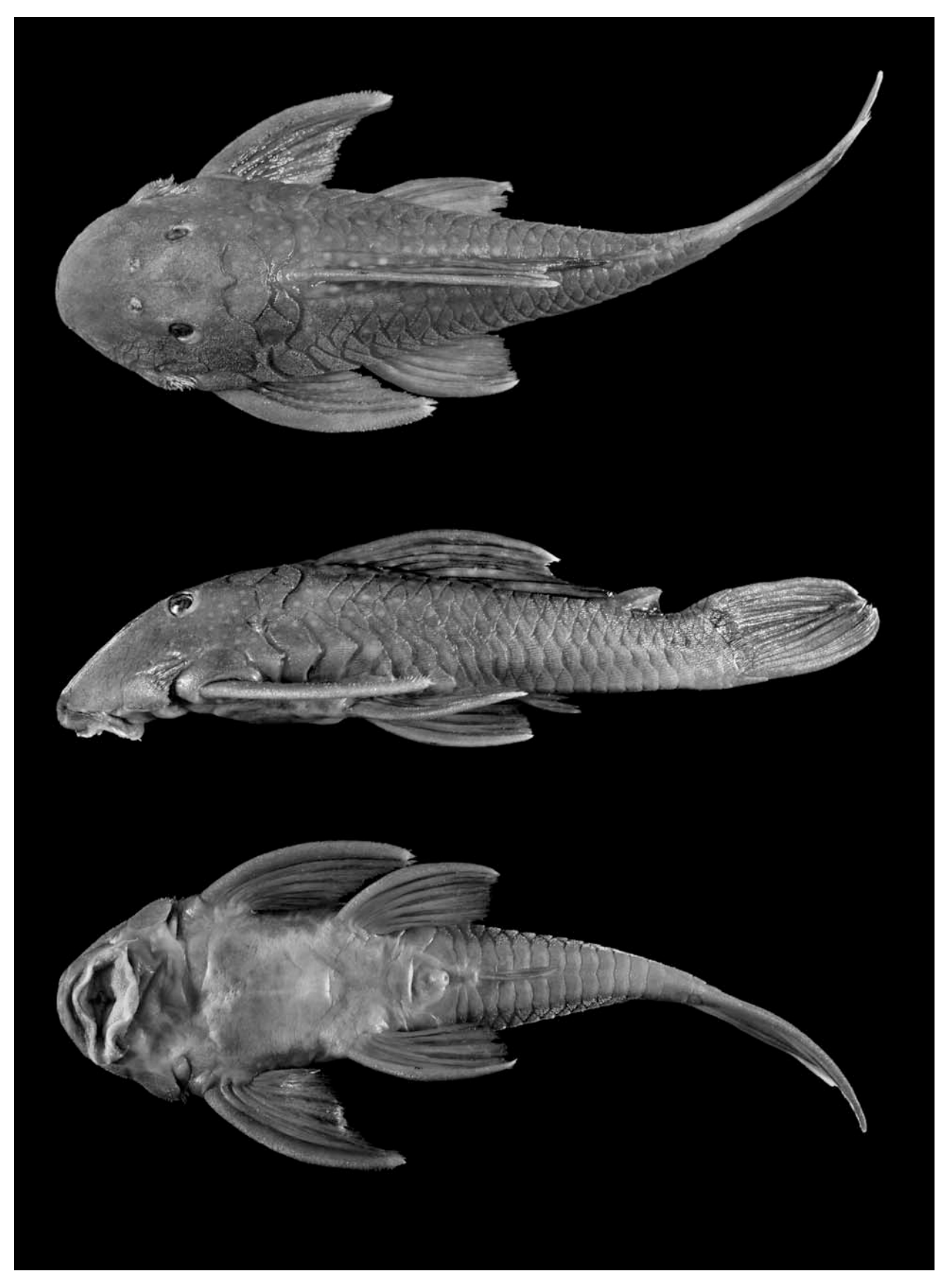
Fig. 2. Baryancistrus demantoides MCNG 54029, 150.5 mm SL; holotype, dorsal, lateral, and ventral views.